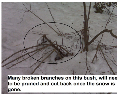
Many broken branches on this bush, will need to be pruned and cut back once the snow is gone.