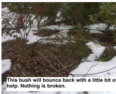
This bush will bounce back with a little bit of help. Nothing is broken.

Some of your smaller plants and shrubs are just now emerging from the snow piles. At this point, we recommend not trying to remove whatever snow is remaining on your shrubs as you have the potential to break additional limbs in the process. After a few more days of 50 degree weather, they should be free of the snow. Ground cover like Ivy, Pachysandra and your grass will be ok once the snow has melted. You just need to be careful and stay off of it, as the ground is very wet and soft, particularly along the sides of the driveways where the snow has been piled.